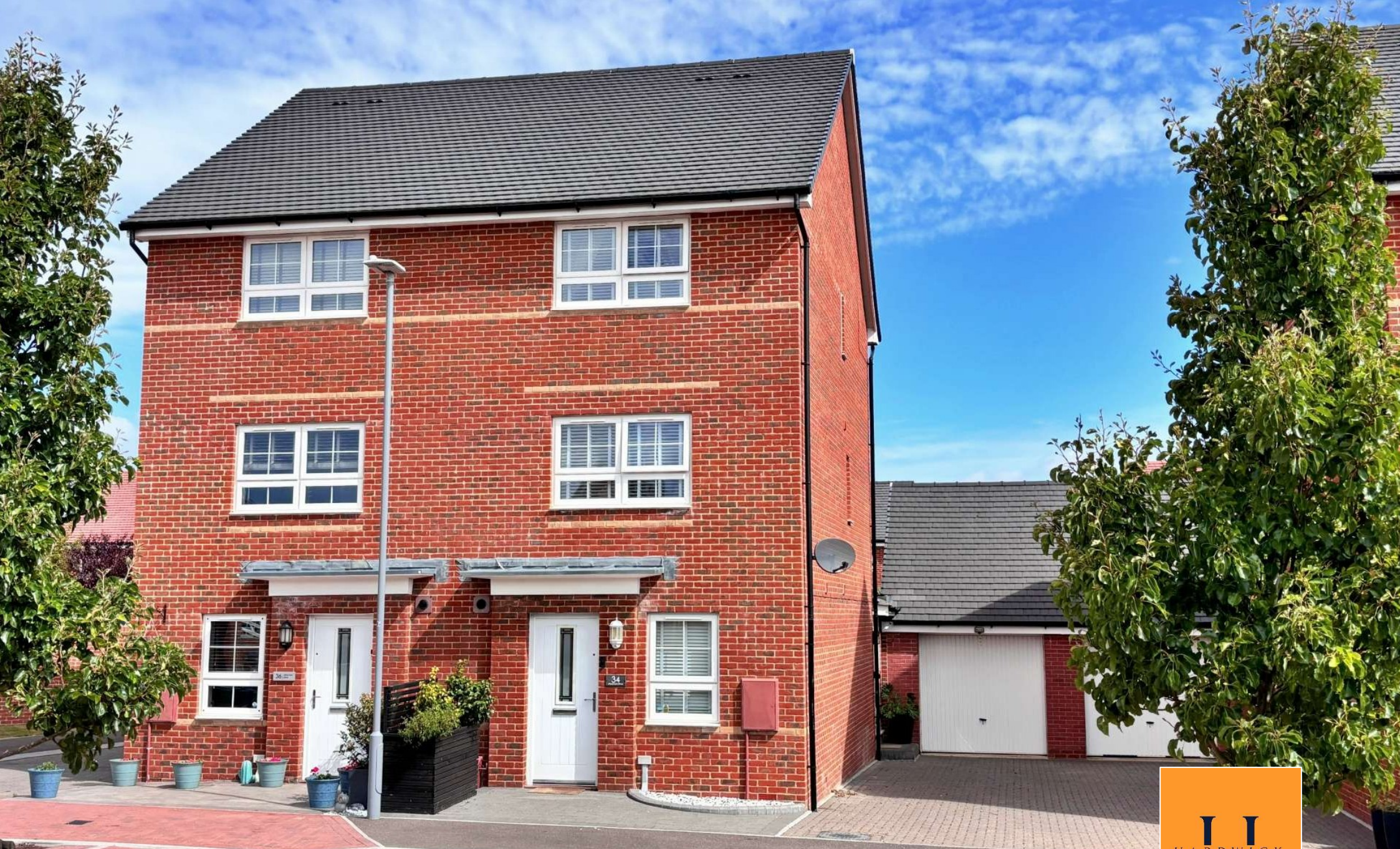
34 Abraham Drive Hamworthy, Poole, BH15 4FU